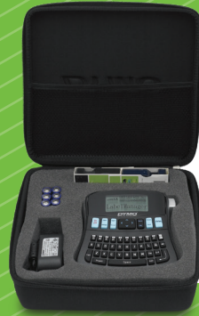
DYMO® LabelManager® 210D Kit Item #DYM1738976