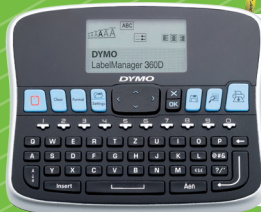
DYMO® LabelManager® 360D Item #DYM1754488