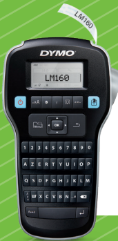
DYMO® LabelManager® 160 Item #DYM1790415