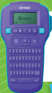
DYMO® COLORPOP!™ Combo Pack Item #DYM2056115