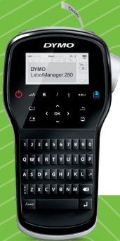
DYMO® LabelManager® 280 Item #DYM1815990